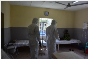
Health workers tend to a patient at one of Sierra Leone's military hospitals.

Scientists have identified a set of biomarkers that indicate which patients infected with the Ebola virus are most at risk of dying from the disease. The results come from a team of 15 scientists at PNNL, who worked with colleagues at the University of Wisconsin-Madison and other institutions. The paper was published in Cell Host & Microbe .